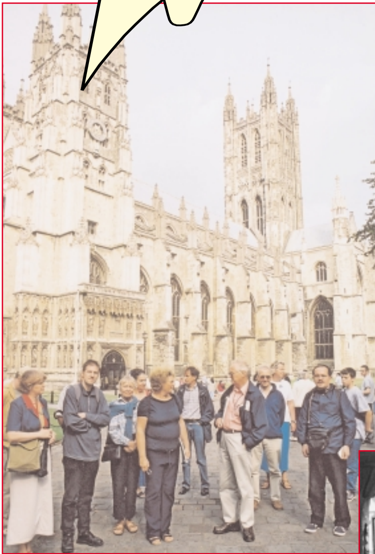
A group of A Canterbury Tale enthusiasts on a guided walk in Canterbury